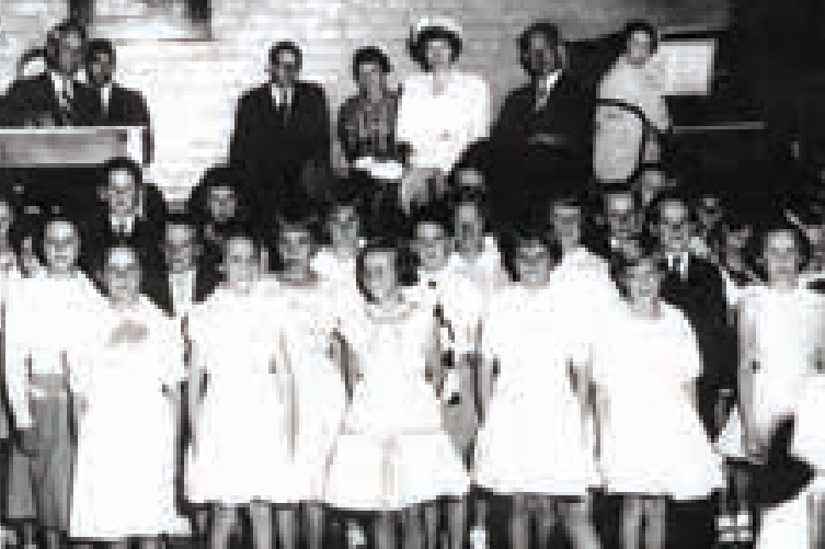
Naturalisation Ceremony at the Spring Hill Hall 25 February, 1959

Brochures of Lucknow and the Orange Heritage Trail can be obtained from the Orange Visitor Information Centre.