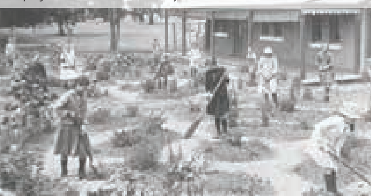
Spring Hill School Garden.

LOOKING WEST ALONG SEATON STREET TO CARCOAR STREET